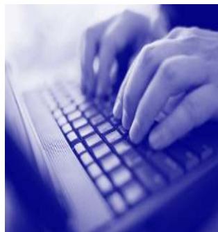
Mobile computer training lab, one Tuesday a month

Computer training classes will be held one day a month in the downstairs meeting room in the town hall. Classes are drop-in sessions and registration is not necessary. This month's class will focus on Microsoft Word and Microsoft Excel. Patrons will learn how to set-up a document, edit their document, create a spreadsheet and personalize their spreadsheet.